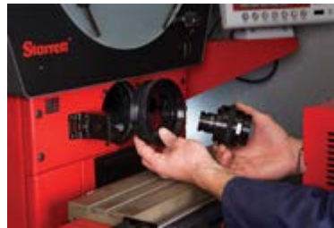
Lenses, Options and Accessories SOLD SEPARATELY