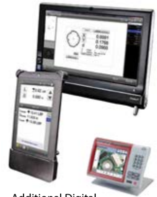
Additional Digital Readouts to choose from