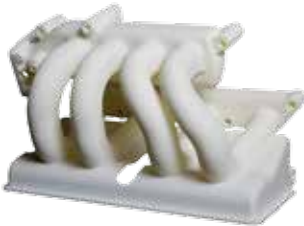
Manifold printed in DuraForm ProX PA

Lower your cost of ownership with automated production tools, remarkably high throughput, material efficiency and repeatability.