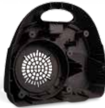
Back cover of vacuum cleaner printed in DuraForm EX Black