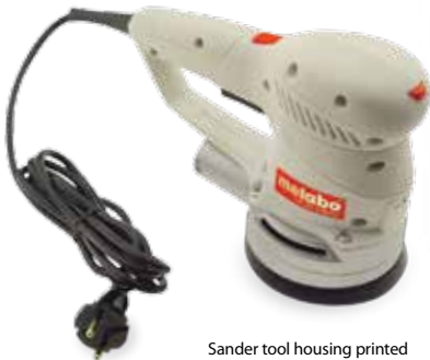
Sander tool housing printed in DuraForm PA material

The sPro SLS systems share a common architecture to produce high-resolution, durable thermoplastic parts available in medium to large build volumes.