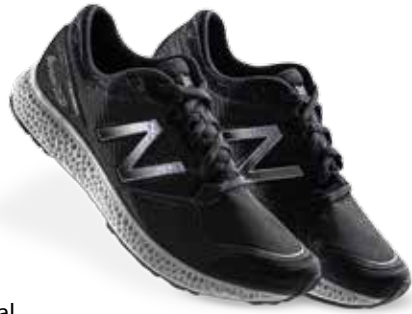
Production running shoe with midsole printed in DuraForm Flex TPU

* Availability varies by printer model (see details on the last page).