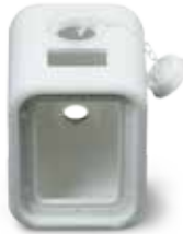
Housing for a laser sensor printed in DuraForm ProX PA