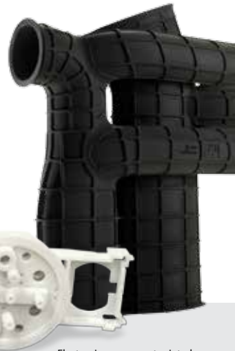
Complex ducting for optimized air flow printed in DuraForm EX Black