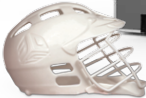
Helmet model printed in Accura Xtreme White 200