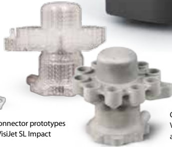
QuickCast® pattern in VisiJet SL Clear, and aluminum casting