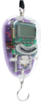
Print transparent, functional components and housings to see internal workings as assembled