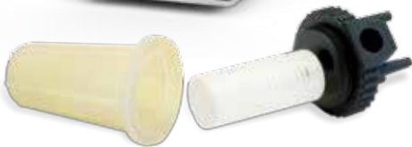
Functional filter prototype printed in clear, white and black rigid plastics

VisiJet M3 materials line delivers toughness, durability, stability, high temperature resistance, watertightness, biocompatibility and castability.