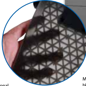
Multi-material prototypes can blend clear, black and white to communicate ideas and simulate finished products