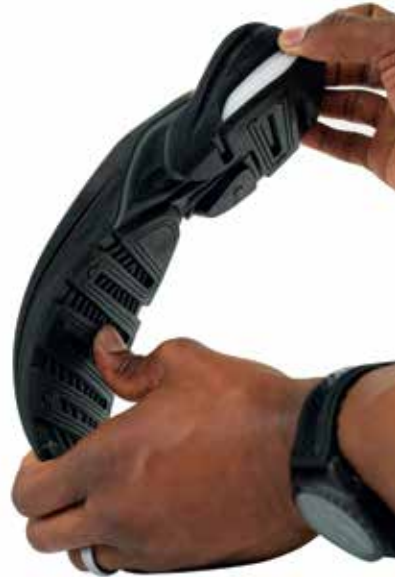
Shoe sole printed in a combination of flexible black elastomer and rigid white plastic

MJP offers exceptional resolution with layer thicknesses as low as 13 microns. Selectable print modes let you choose the best combination of resolution and print speed, so it's easy to find a combination that meets your needs. Parts have smooth finish and can achieve accuracies approaching SLA precision for many applications.